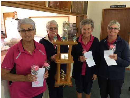
Winners with the Margaret Sadler Memorial Trophy